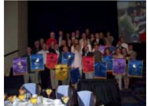
Above: NCAHU National Convention attendees pose with awards banners in New York City.