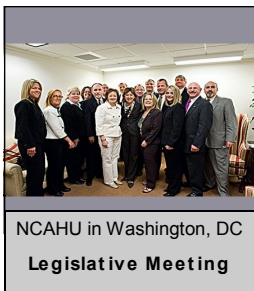
NCAHU in Washington, DC Legislative Meeting