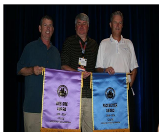
CAHU 2009 Awards Pacesetter and Web Design