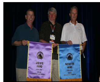
CAHU 2009 Awards Pacesetter and Web Design