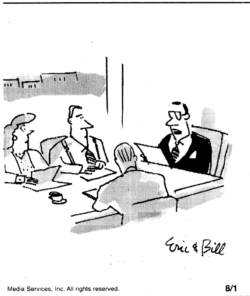
Media Services, Inc. All rights reserved.

Post your event at Events.StarNewsOnline.com . Include event description, date, time, cost and address. Listings must include a contact name and phone number.